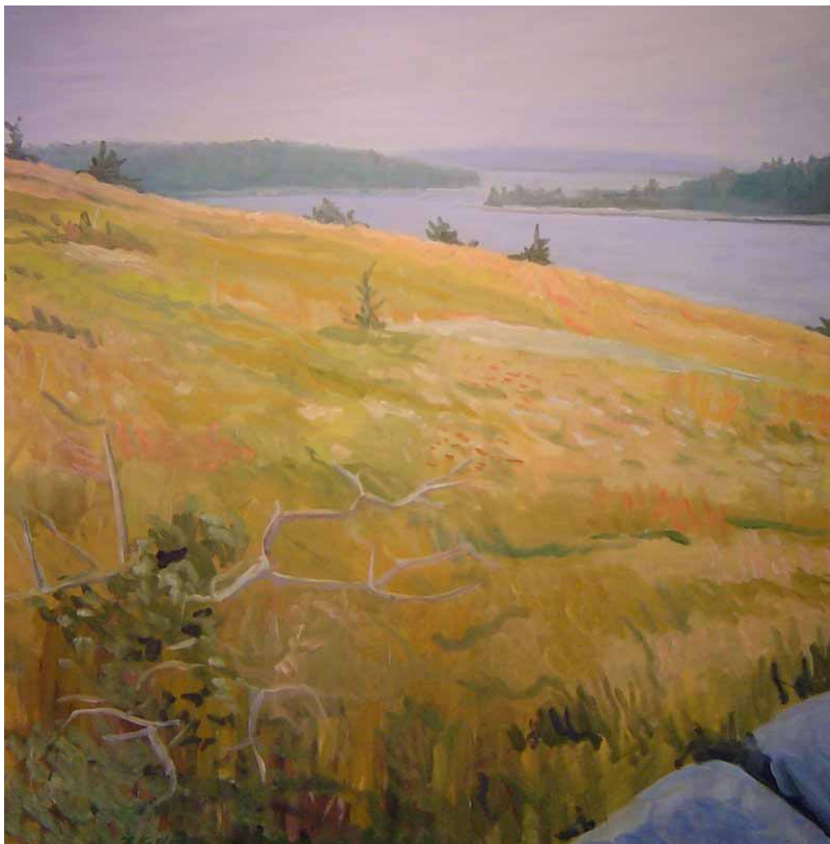
EASTERLY BREEZE oil on canvas 48 x 48 inches