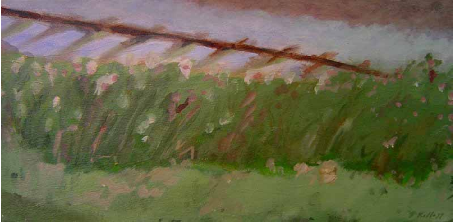
WILDFLOWERS BY TRACK oil on canvas 8 x 16 inches