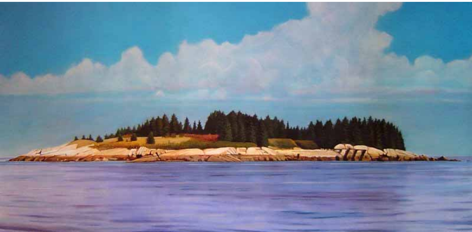
ISLAND oil on canvas 4 x 8 feet