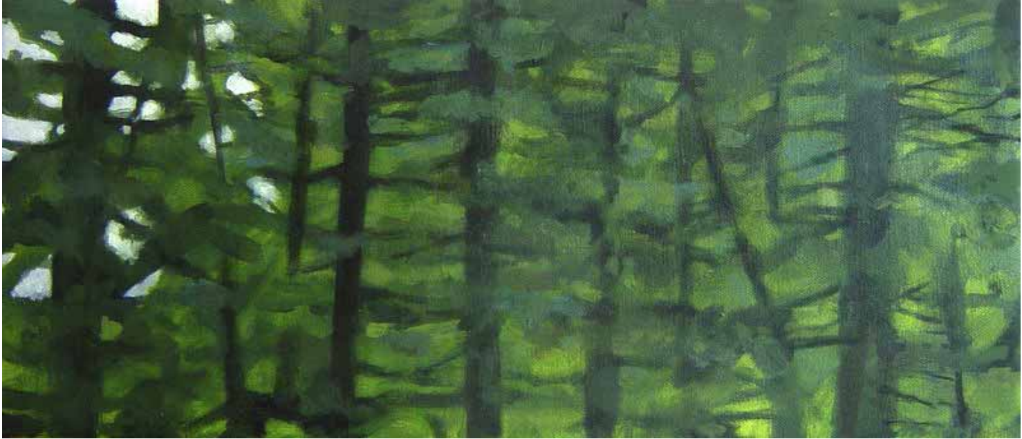
WOODS oil on canvas 7 x 16 inches