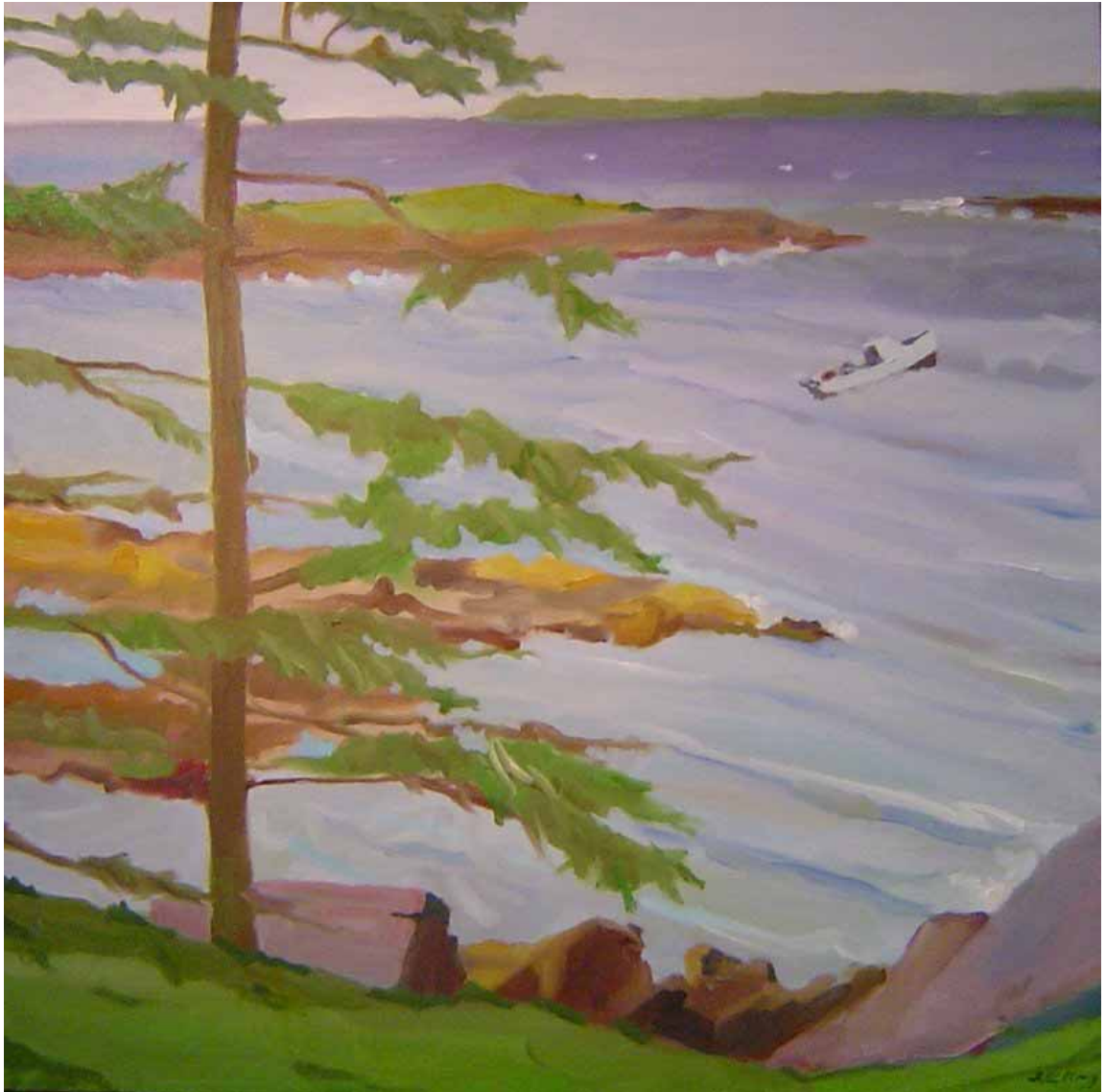
OLD TREE ON MAGEE ISLAND oil on canvas 24 x 24 inches