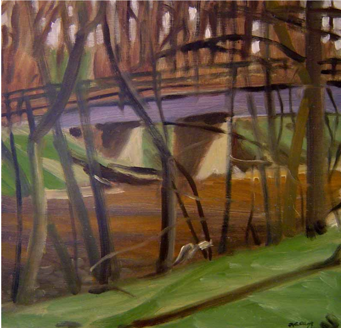
BRIDGE ON ROCK CREEK oil on panel 11 x 11 inches