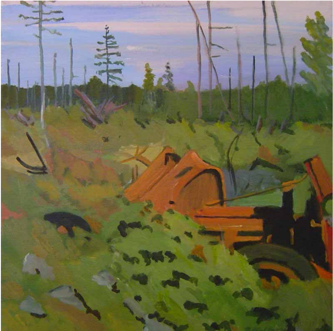
ISLAND DUMP WITH RUSTY TRUCK oil in canvas 14 x 14 inches