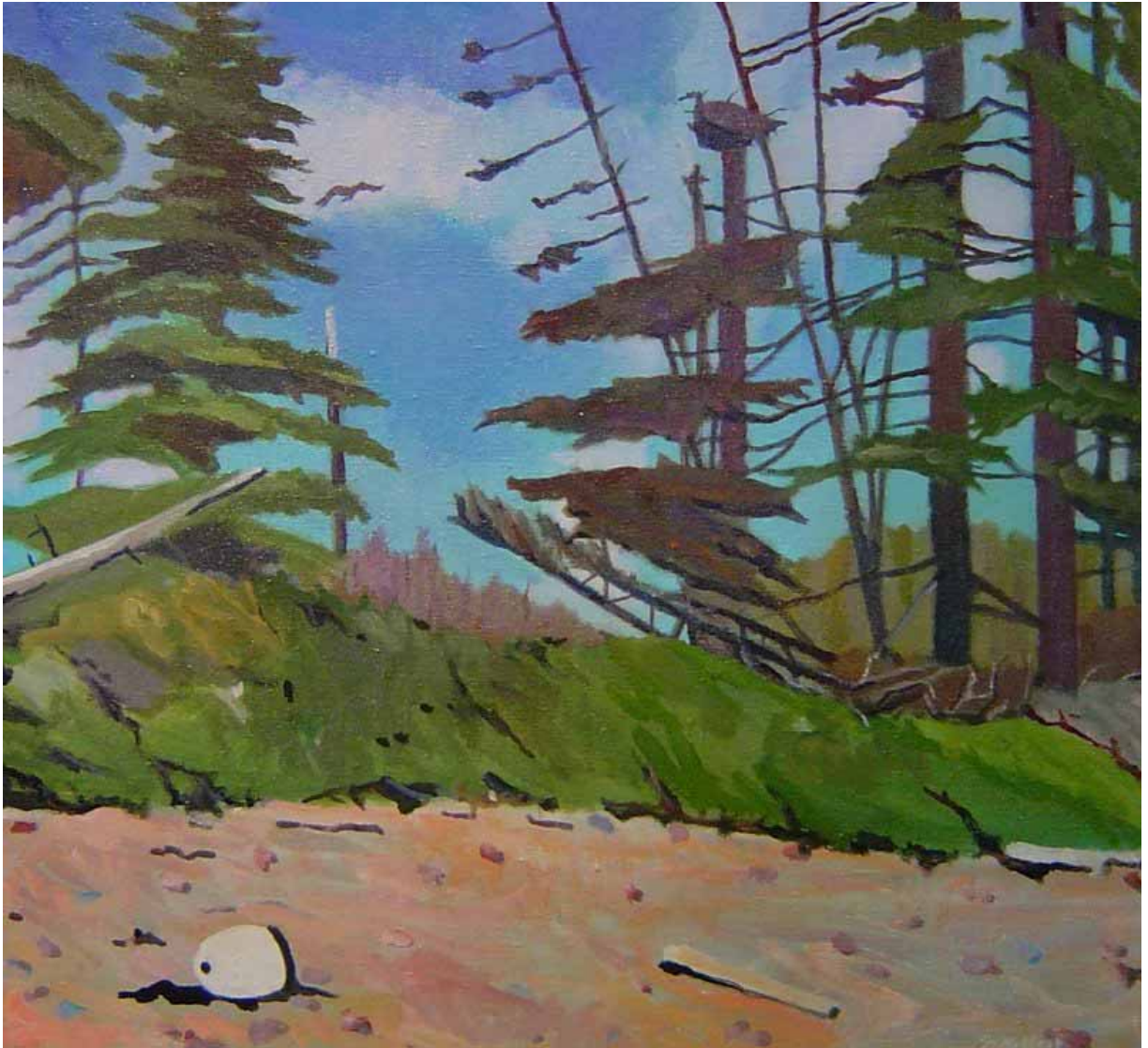
OSPREY NEST oil on linen 22 x 24 inches