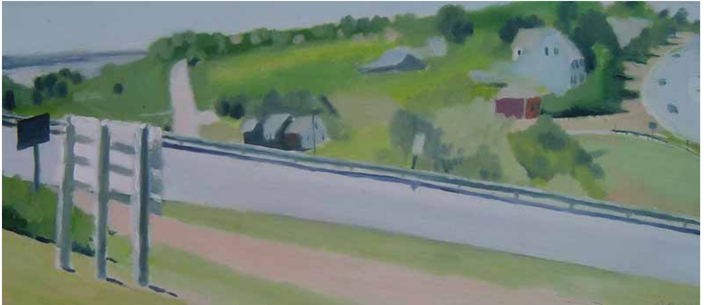
ROUTE 131 oil on panel 8 1/2 x 19 inches