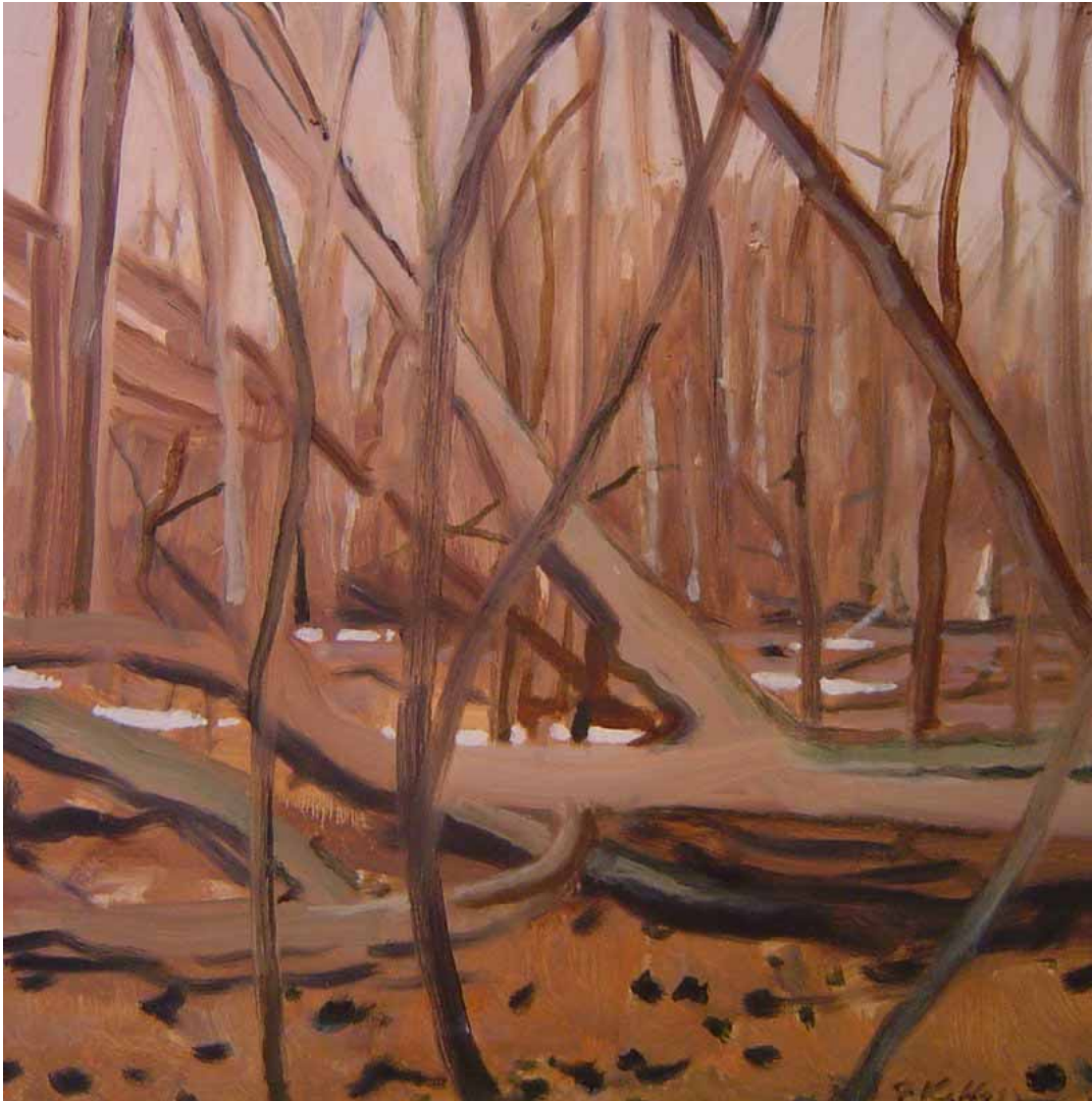
MELTING SNOW oil on panel 11 x 11 inches